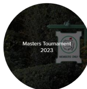
Masters Tournament 2023