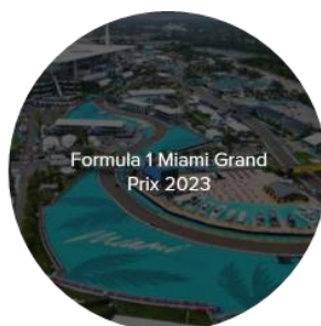
Formula 1 Miami Grand Prix 2023